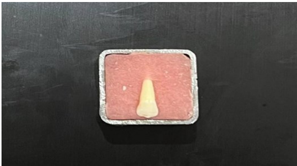
Figure1: extracted upper first premolar embedded in acrylic resin.

The labial surface of each tooth was positioned parallel to the shearing force. Specimens of teeth were sorted into four groups of ten at random. Orthodontic stainless steel maxillary first premolar brackets equilibrium® 2 with roth 22 prescription (Dentaurum, ispringen, germany) are utilized in this study because of their universality that can be used on left and right maxillary first or second premolars. Four different types of orthodontic adhesives were tested in this research including Transbond™ XT Light cure adhesive paste (3M Unitek, Monrovia, California, USA), Heliosit® Orthodontic (Vivadent, Schaan, Liechtenstein), Orthobond plus color change adhesive (Morelli Ortodontia, Alameda Jundiaí, Brazil) and Smart Ortho Adhesive bond (Dongtancheomdansaneop 1-ro, Hwaseong-si, Gyeonggi-do, Korea). Each tooth was blindly assigned to one of