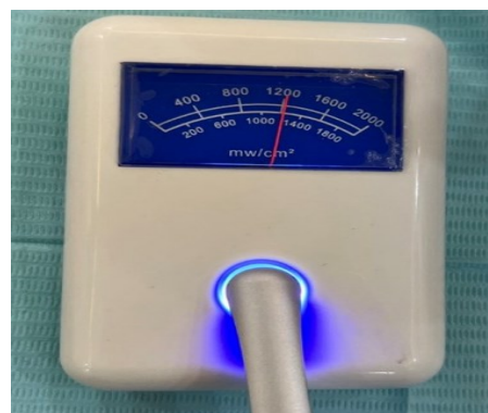
Figure 2: Calibrating light output intensity with radiometer.

Following bonding, all samples were kept in distilled water at room temperature for 24 hours before being examined using a universal testing machine in the shear mode ( Terco MT-3037, USA) (Figure 3).