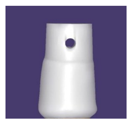
Figure 1: Design of zirconia crown with occlusal ring.

Utilizing a CAD/CAM system, we created zirconia crowns in this investigation using five Yttria tetragonal zirconia polycrystalline high transparent (5Y-TZP/VITA YZ® HT, shade white, VITA Zahnfabrik, Germany) in accordance with the measurements and design of the Kim et al. [11] study, as figure (1):