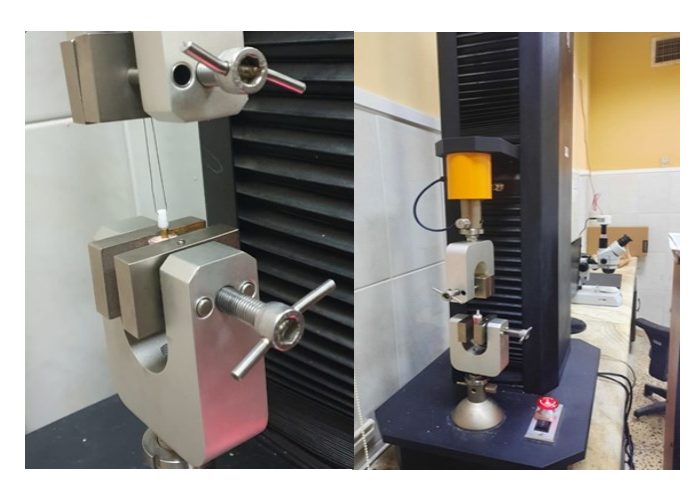
Figure 4: Universal testing machine for measurement of tensile bond strength and samples pulled with this device.